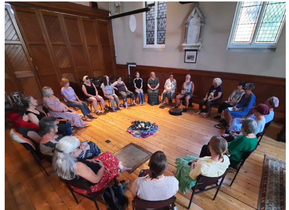
Local organisations have made use of the church for meetings and consultations - above "Explore and Draw" - getting inspiration from many sources.